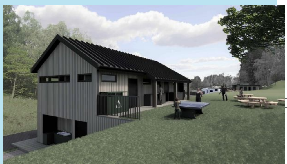
One of three buildings